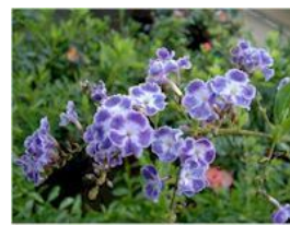
Duranta. Geisha Girl